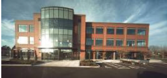
Rectilinear wide angle lens

The two families of wide angle lenses create very different views of the world.