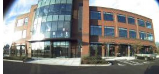
Barrel distortion wide angle lens

Most wide angle lenses including fisheye lenses have barrel distortion which comes from imaging equal angular slices of the world onto the sensor. A close kin, similar in application but different design, is to image equal planar distances in the real world onto the image sensor using a rectilinear lens. Until recently, rectilinear lenses were not available for wide angle applications. Theia Technologies has worked to develop this type of lens .