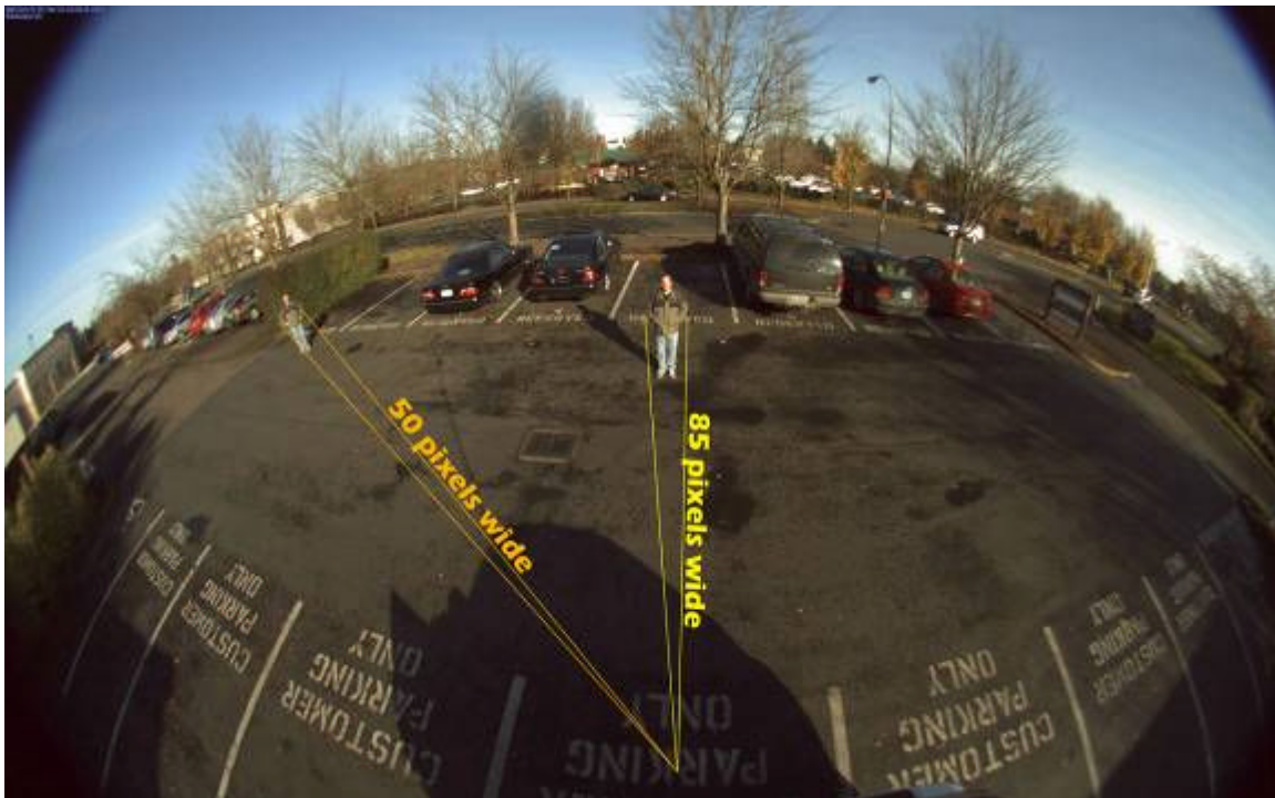
Distortion reduces the object width the further it is from the image center.

The wide angle cousin of the rectilinear lens has the well known barrel distortion seen in almost all wide angle lenses with fields of view greater than 80deg, including fisheye lenses. This distortion causes the image to look curved and resolution to be reduced as the object moves farther from the center of the image.