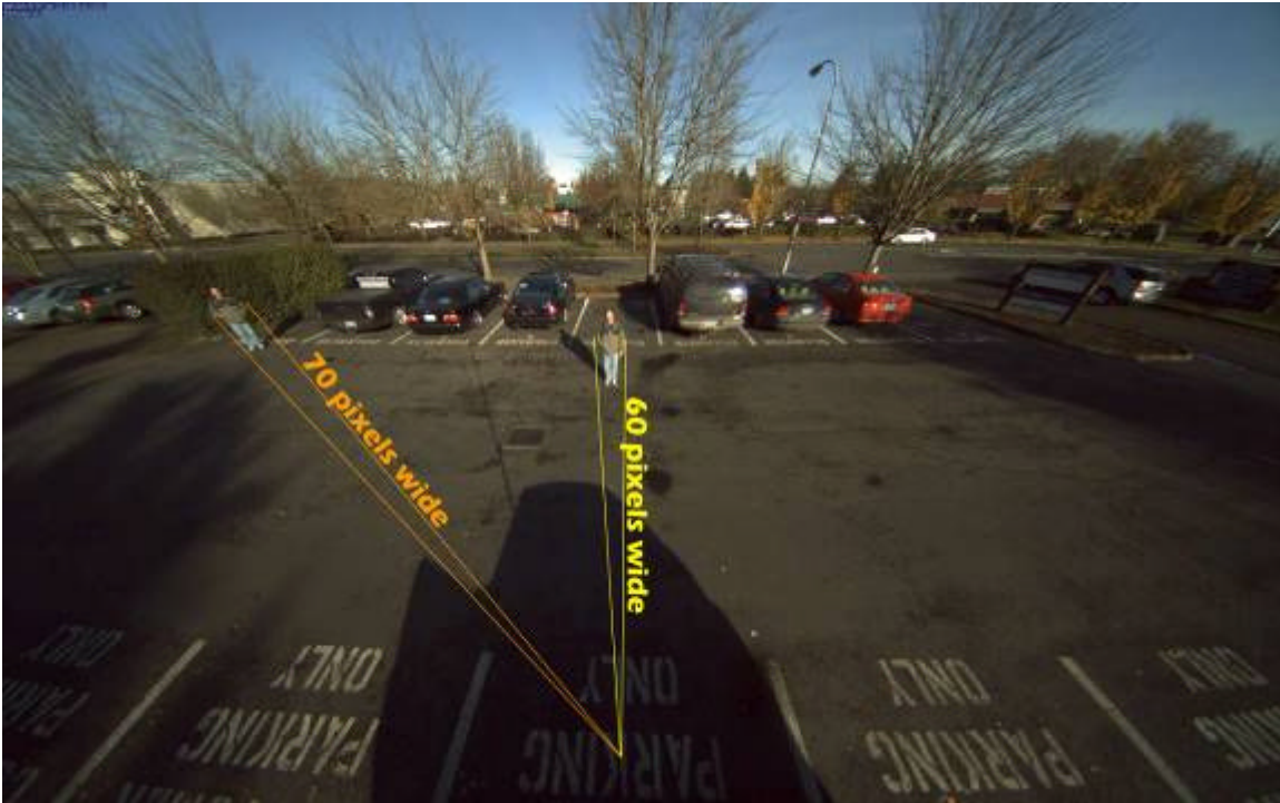
The same image taken with a rectilinear lens shows increased resolution towards the edge of the image.

The distortion effect can be eliminated with software (creating a rectilinear lens image) but at a cost in time or processing power. Objects at the edges of the image are compressed and detail information is lost. The information was already lost travelling through the lens and no amount of software (contrary to Hollywood's view of video surveillance) will be able to recapture the information.