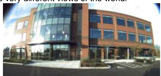
Barrel distortion wide angle lens

Most wide angle lenses including fisheye lenses have barrel distortion which comes from imaging equal angular slices of the world onto the sensor. A close kin, similar in application but different design, is to image equal planar distances in the real world onto the image sensor using a rectilinear lens. Until recently, rectilinear lenses were not available for wide angle applications. Theia Technologies has worked to develop this type of lens.