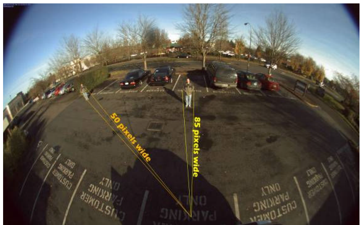
Distortion reduces the object width the further it is from the image center.

The wide angle cousin of the rectilinear lens has the well known barrel distortion seen in almost all wide angle lenses with fields of view greater than 80deg, including fisheye lenses. This distortion causes the image to look curved and resolution to be reduced as the object moves farther from the center of the image.