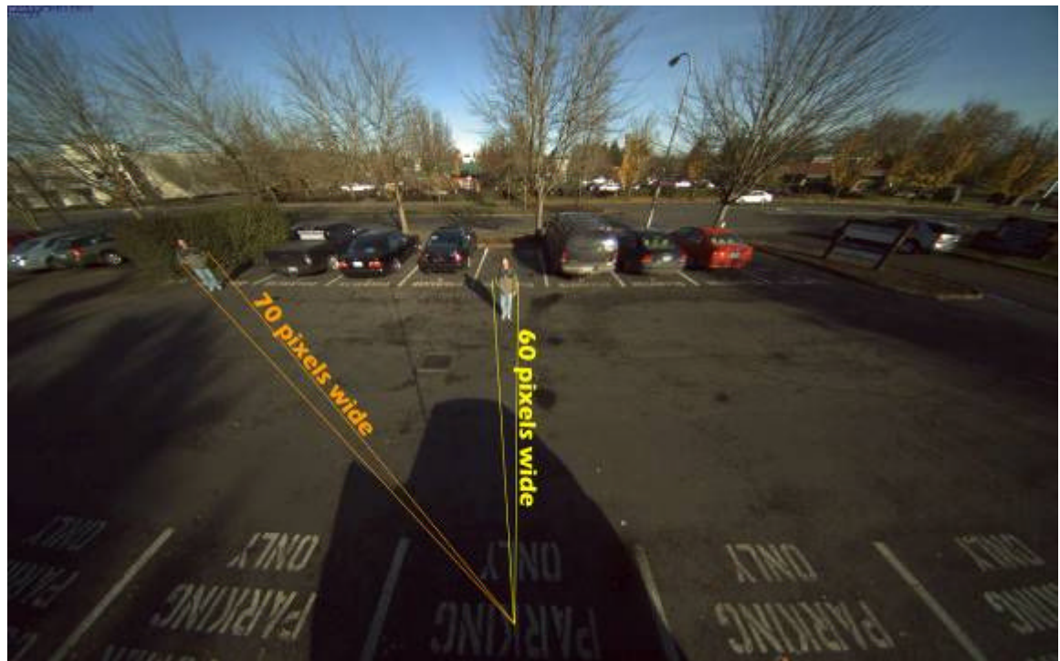
The same image taken with a rectilinear lens shows increased resolution towards the edge of the image.

The distortion effect can be eliminated with software (creating a rectilinear lens image) but at a cost in time or processing power. Objects at the edges of the image are compressed and detail information is lost. The information was already lost travelling through the lens and no amount of software (contrary to Hollywood's view of video surveillance) will be able to recapture the information.