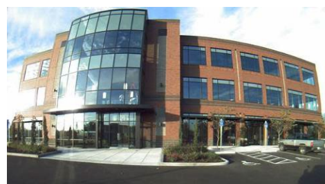
Typical wide angle lens