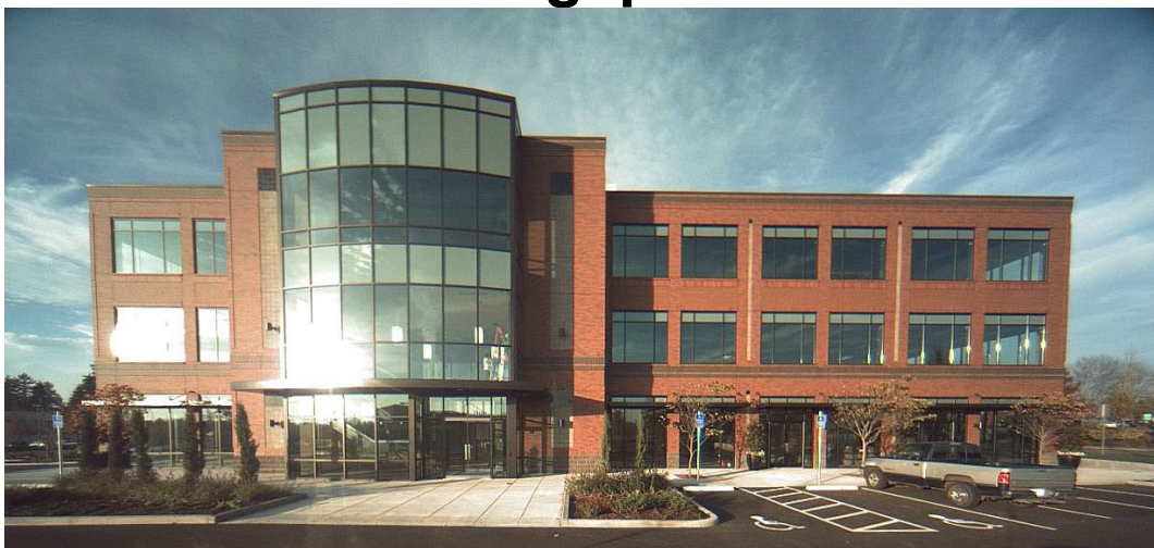
125° without distortion